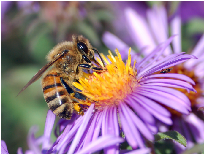
Pollinators at Work